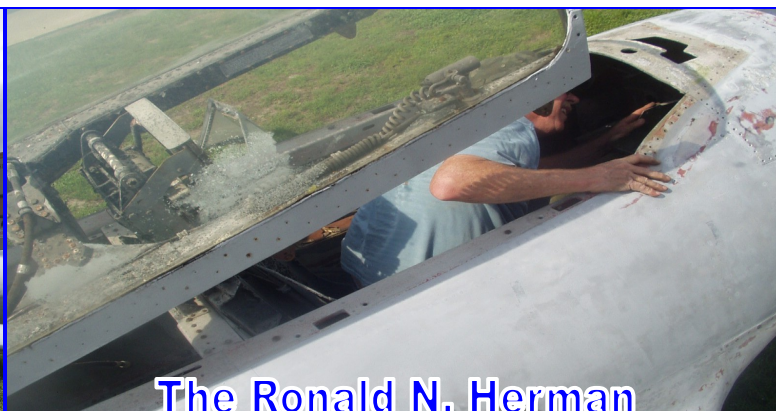
The Ronald N. Herman