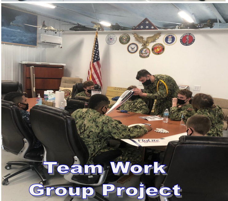
Team Work Group Project