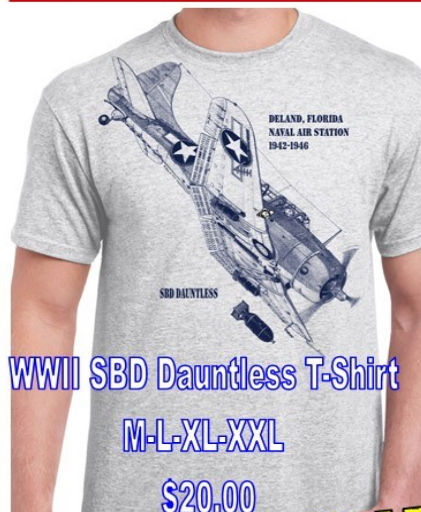
WWII SBD Dauntless T-Shirt