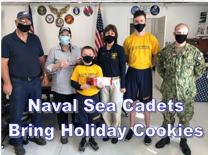
Naval Sea Cadets Bring Holiday Cookies