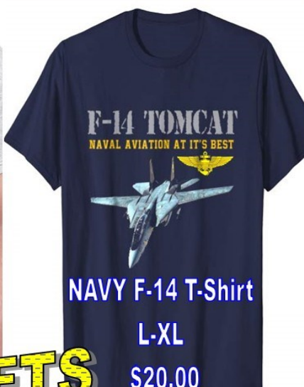
NAVY F-14 T-Shirt