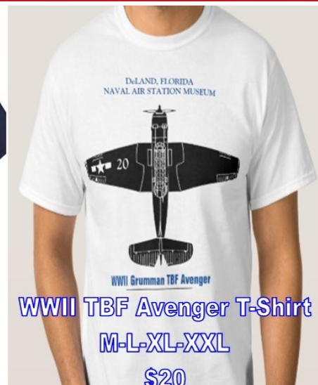
WWII TBF Avenger T-Shirt