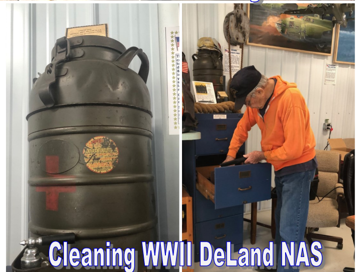
Cleaning WWII DeLand NAS File Cabinet & Hospital Coffee Pot