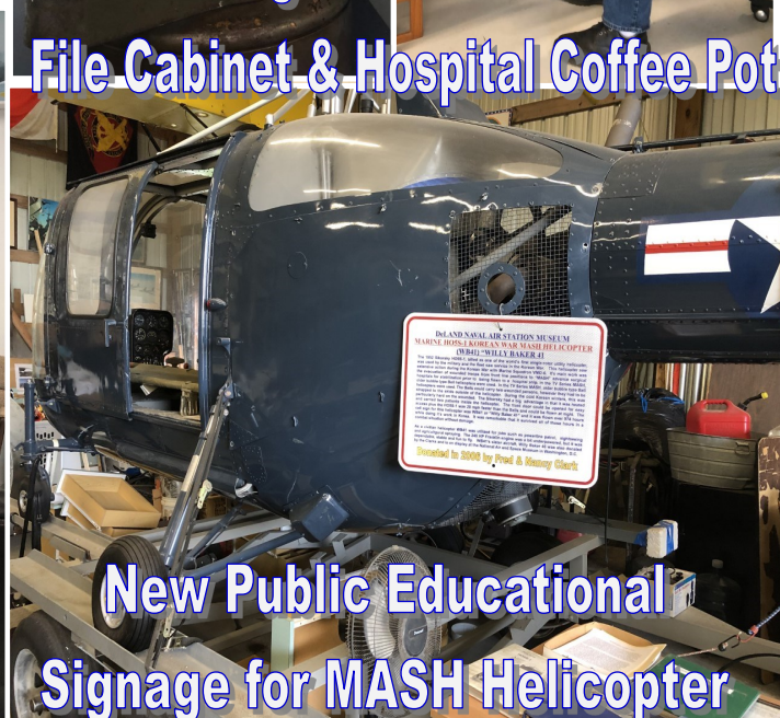
New Public Educational Signage for MASH Helicopter